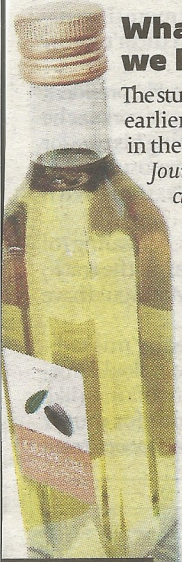
OLIVE OIL | Has 'healthy' fats